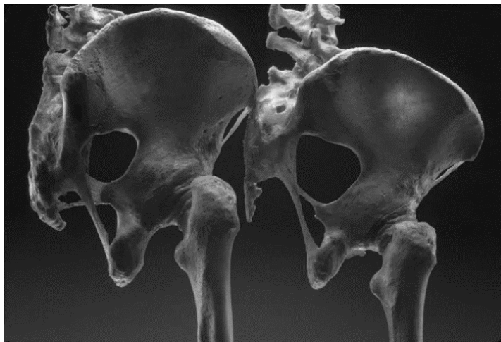
Figure 1 - The male and female pelvis skeletal [Left] Male pelvis. [Right] Female pelvis.

A skeleton's overall size and sturdiness give some clues. Within the same population, males tend to have larger, more robust bones and joint surfaces, and more bone development at muscle attachment sites. However, the pelvis is the best sex-related skeletal indicator, because of distinct features adapted for childbearing. The skull also has features that can indicate sex, though slightly less reliably.